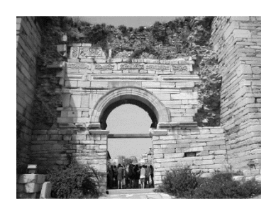
Laodicea

Laodicea had a small problem: earthquakes. This area seems to be plagued with natural disasters. Every time this great city began to enjoy their wealth, wham, another disaster. By the time John began to write about this church, they had regained their glory and wealth lost during the great earthquake of AD 62. From all accounts in Revelation, this wealth greatly affected the condition of the church. It appeared strange that their riches and sorrow were consistently in harmony with each other. God said that the love of money is the root of all evil and that certainly was the case with Laodicea. Very few rich people serve God and very few rich churches serve God. Money is a compulsive substance, which acts like a master all by itself. Jesus stating that it was easier for a camel to get through the eye of a needle than for a rich man to get into Heaven clearly communicates the problem with Laodicea. We could actually rephrase the statement to be "It is easier for camel to go through the eye of a needle than it is for a rich church to get into Heaven." A fact that is difficult for us to understand is that riches and True Spirituality somehow do not mix. They are like oil and water; as long as you shake it up (earthquakes), you can eat from it.