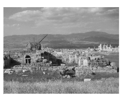
Laodicea: Print by Wikipedia

The church of Laodicea reveals the details of the final state of apostasy. Laodicea was located about 40 or 50 miles east of the church of Ephesus. The city's name comes from the wife of Antiochus II (Laodice), the Syrian who ruled in the early days of the city in and around 261 BC . The town didn't amount to much until it came under the rule of Achaeus in 220 BC . The town became a city and the city became known for their wealth, and I mean wealth. In fact, by the time of John, it became the most important and flourishing commercial city of Asia Minor.