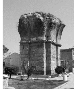
Great Pillar: Church of Philadelphia

Interesting Note: To this day, the Turkish government barely acknowledges the existence of this community. They place no link or ads to this community whatsoever. In spite of all their refusal to acknowledge the one and only True Christian community of Turkey, the town still prospers in faith. It is one of the great wonders of church history!